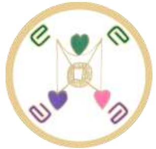
Protecting Your Power Balanced in Love©