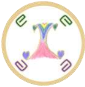
Grounded and Protected in Love©