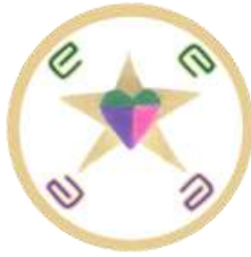
Love & Trust©