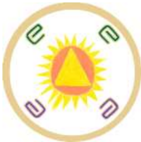
Solar Plexus Chakra©