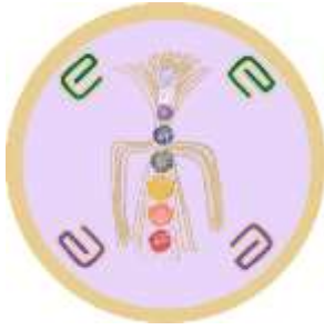
Chakra Opening & Balancing©