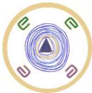
Third Eye Chakra©