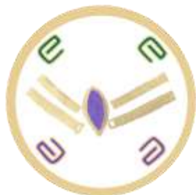
God/Universal Intelligence Connection©